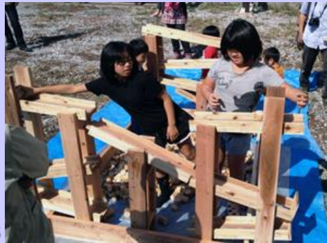
Wooden play equipments