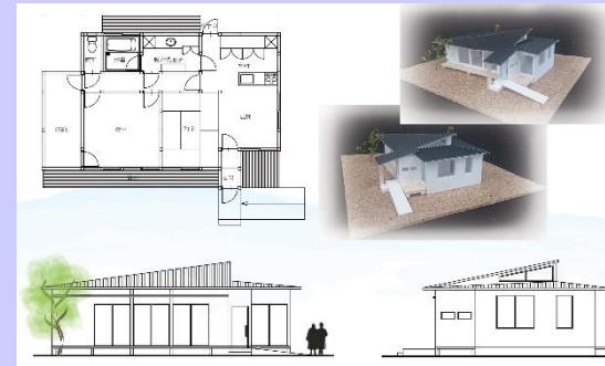
Student's proposal of Wooden house